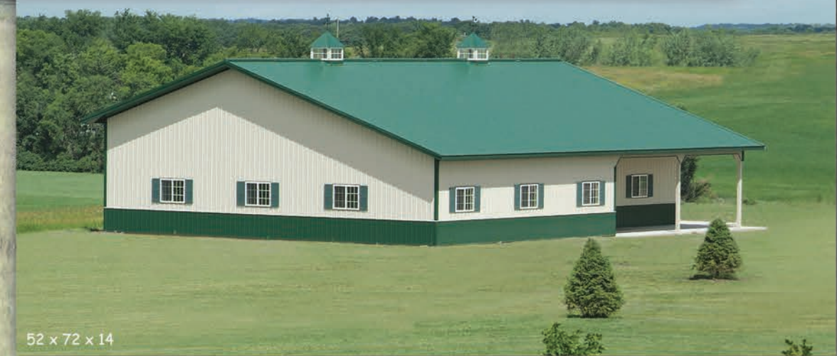
52 x 72 x 14

We construct each building as if we were building it for ourselves. Our staff is continually seeking the best building components and the best engineering design ideas that make our buildings the best in the business.