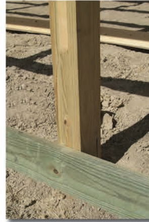
2X8 Treated bottom nailer

We use the best select grade high performance Machine-Stress Rated lumber throughout.