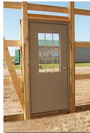
Three ply column on both sides of door frame.