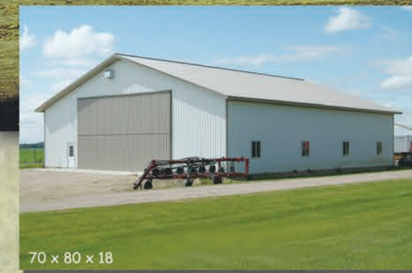
70 x 80 x 18