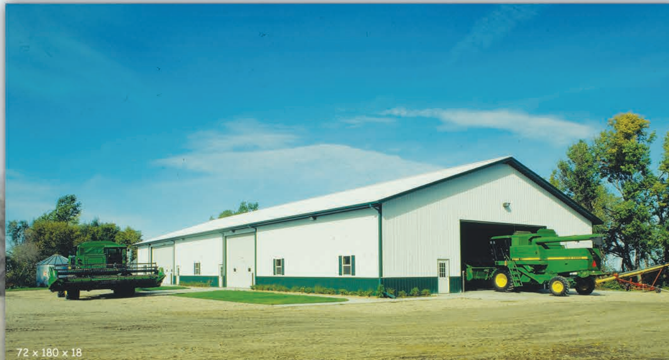
72 x 180 x 18