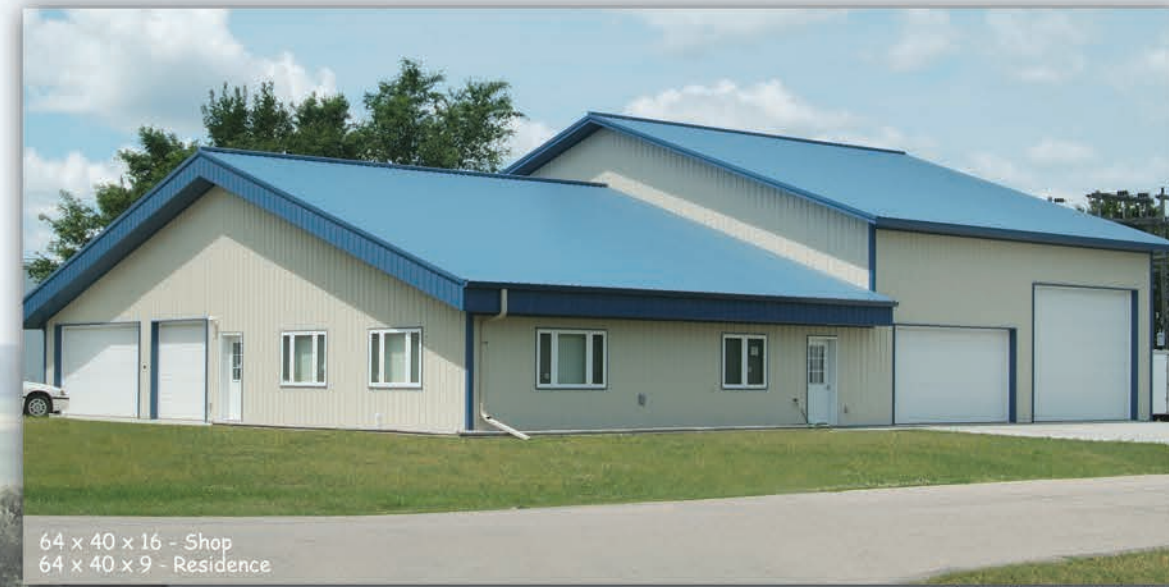
64 x 40 x 16 - Shop 64 x 40 x 9 - Residence