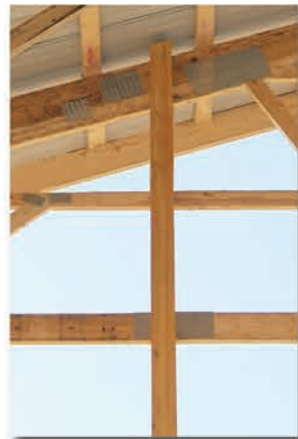
Three ply columns to top of roof truss.