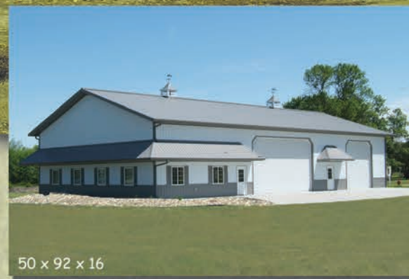
50 x 92 x 16